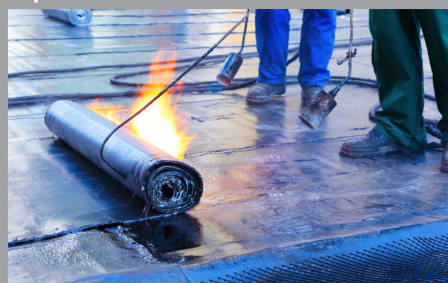
One of the common applications for these filters, is to address odors created during nearby tarred roofing replacement or repairs. Carbon pleats offer a good solution

The CityPleat features a combination filter that removes particulate, gases, and odors. It is recommended for use in all types of HVAC systems (both indoor and outdoor air) in a wide variety of residential and commercial applications when only a 1", 2" or 4" space is available.